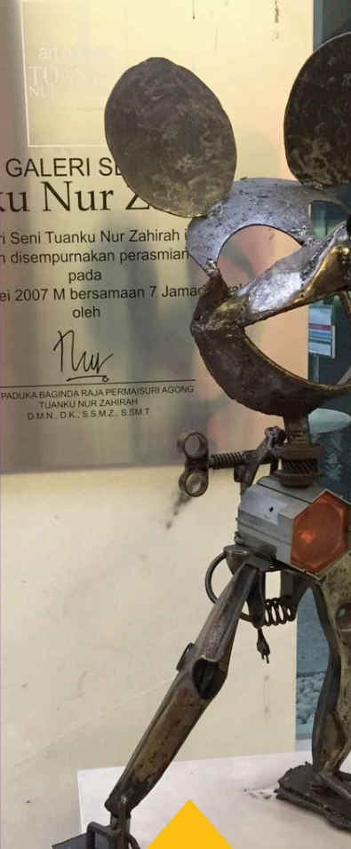
art gallery TUANKU NUR ZAHIRAH GALERI SENI Tuanku Nur Zahirah Seni Tuanku Nur Zahirah disempurnakan perasmian pada 2007 M bersamaan 7 Jamad oleh Nur PADUKA BAGINDA RAJA PERMAISURI AGONG TUANKU NUR ZAHIRAH D.M.N., D.K., S.S.M.Z., S.S.M.T.